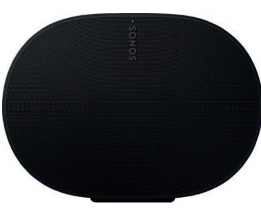
Colours: Black and white