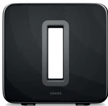
Colours: Black and white

If you want a little more, the Sonos soundbars can be expanded with the Sonos subwoofer and the Sonos surround speakers.