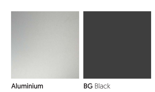
Colour TV column